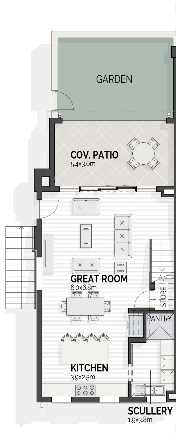
GROUND STOREY PLAN SCALE 1:100 ON A3 PAGE NORTH ORIENTATION AS PER SITE PLAN