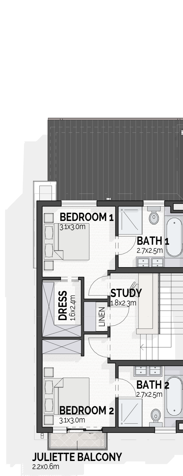
FIRST STOREY PLAN SCALE 1:100 ON A3 PAGE NORTH ORIENTATION AS PER SITE PLAN