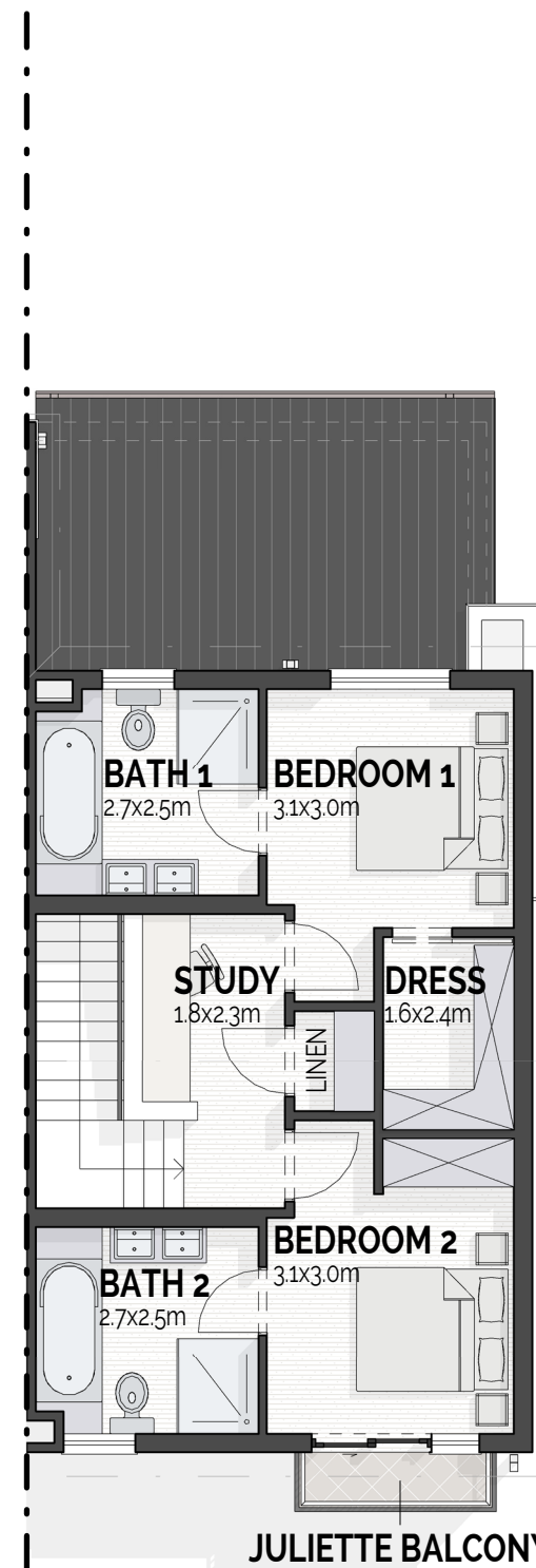
FIRST STOREY PLAN SCALE 1:100 ON A3 PAGE NORTH ORIENTATION AS PER SITE PLAN