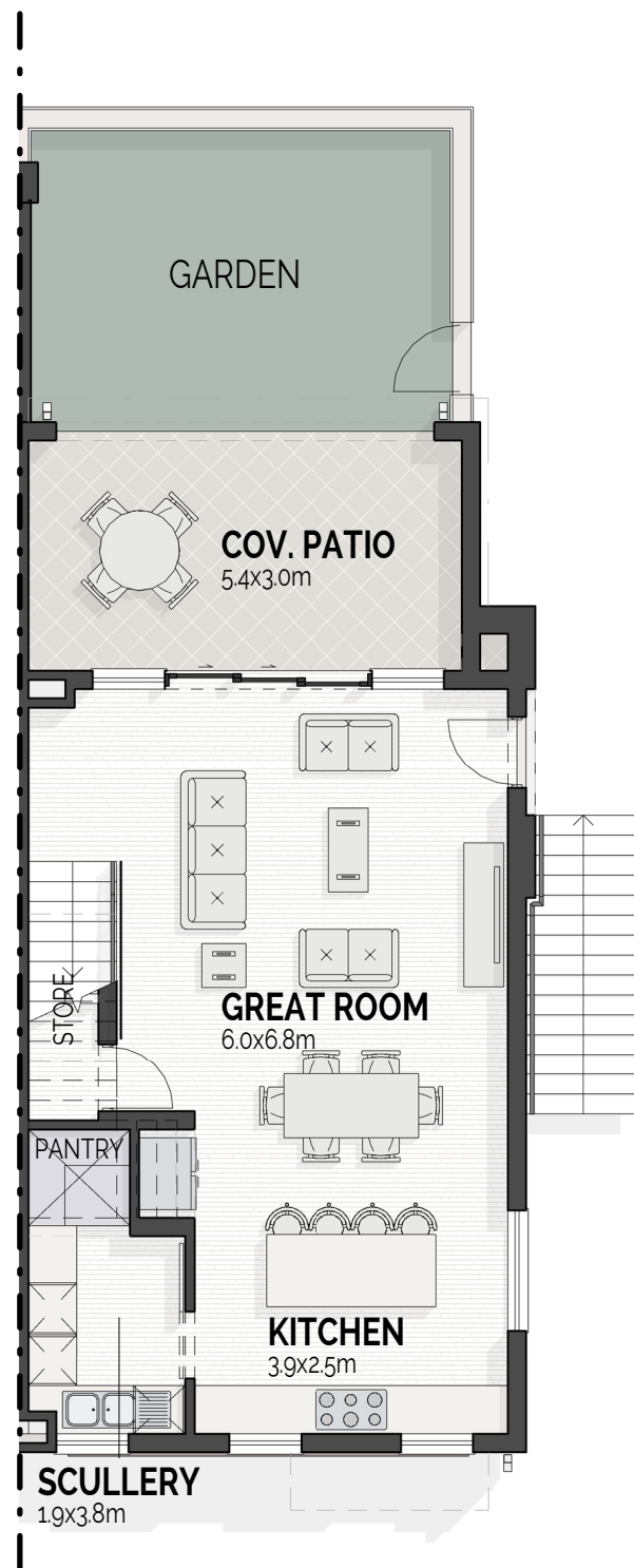
GROUND STOREY PLAN SCALE 1:100 ON A3 PAGE NORTH ORIENTATION AS PER SITE PLAN